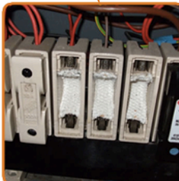
Main panel & fuse box