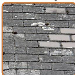
Roof felts & shingles