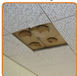
Acoustic ceiling tiles