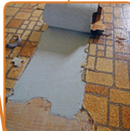
Vinyl tiles & lino flooring