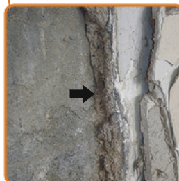
Gypsum board filling