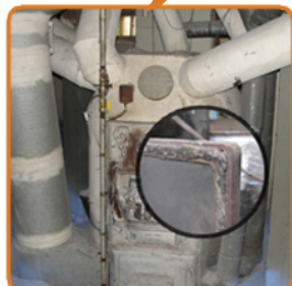
Heater insulation & doors