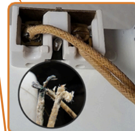
Outlets & wire insulation