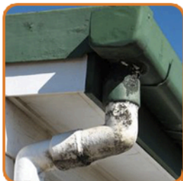
Gutters & downspouts